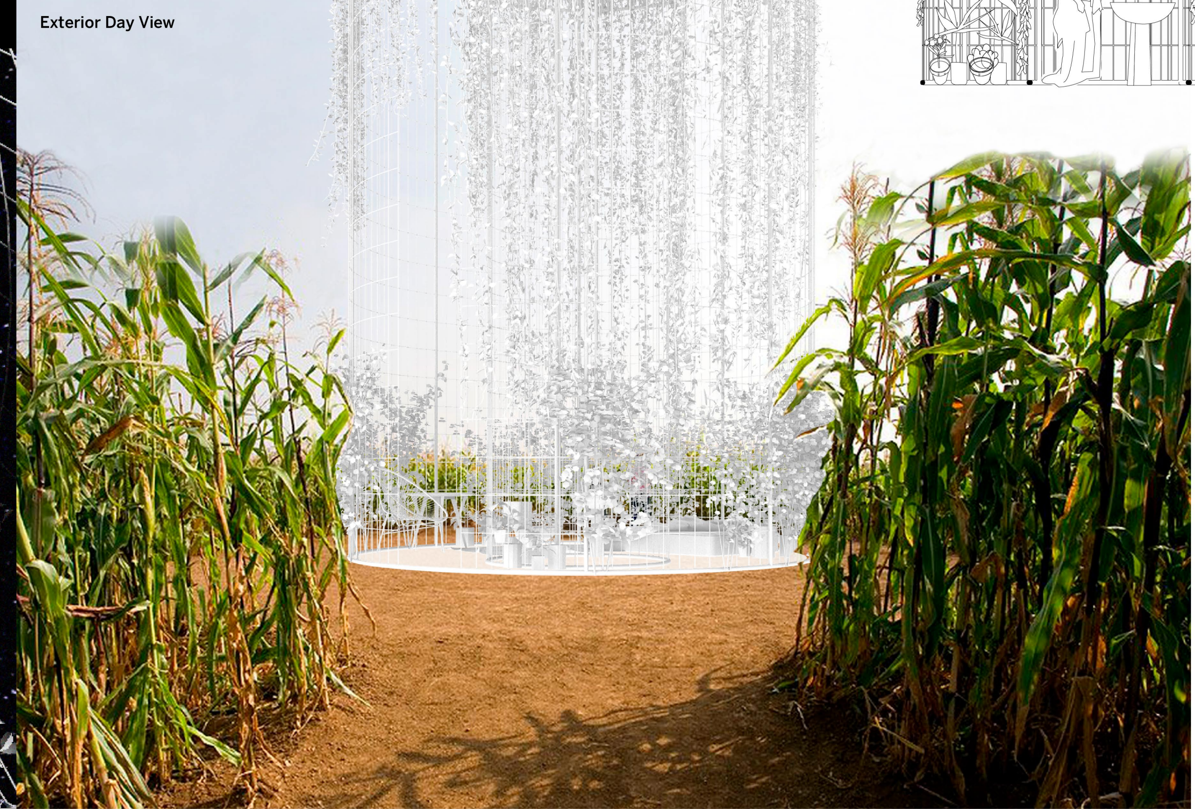
Exterior Day View

Reutilización de los almacenes de mazorcas de maíz