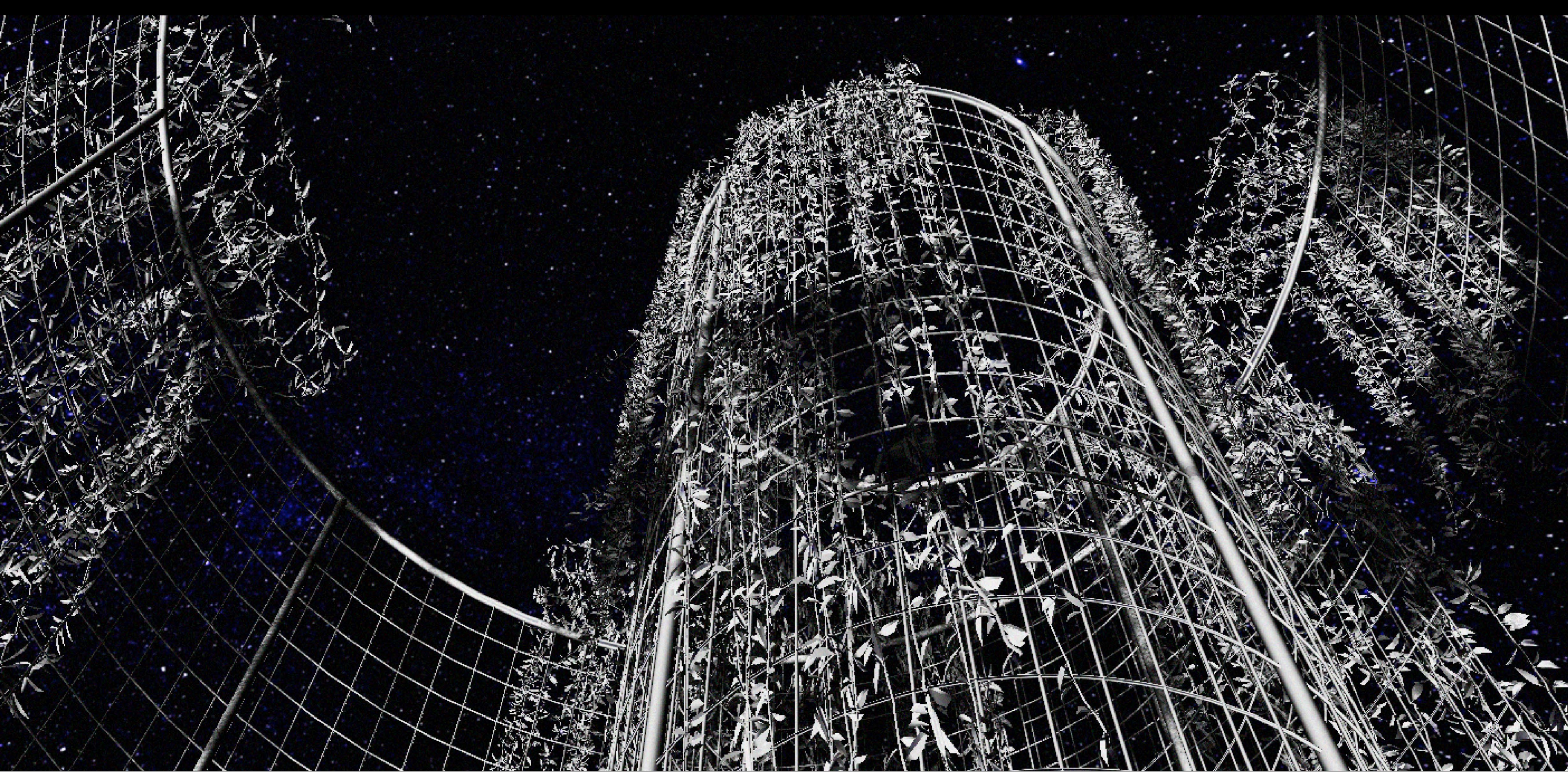
Interior Night View