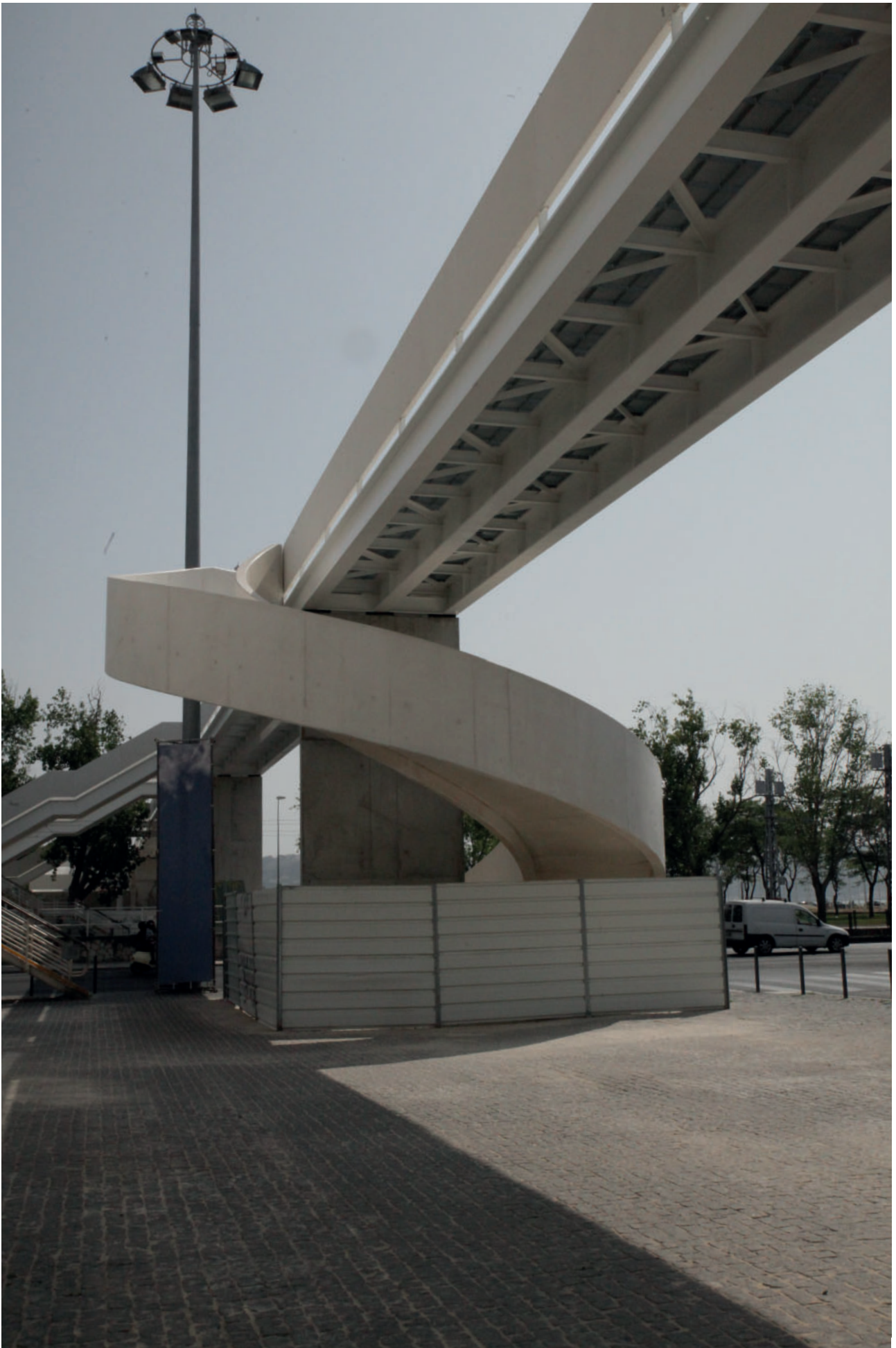
Picture of the bridge of the National Coach Museum of Lisbon by Mendes da Rocha. Francesco Caneschi, 2020.