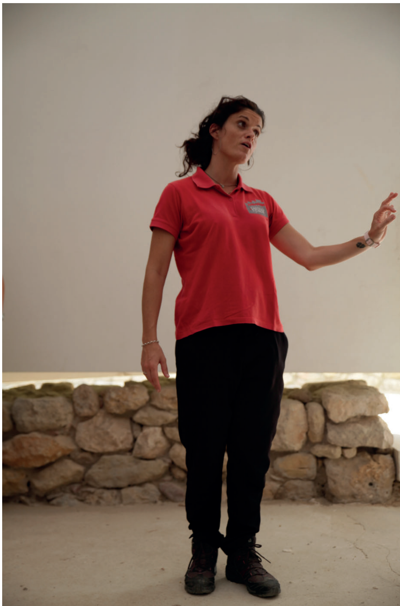
Picture of the São Jorge Castle, rehabilitated by Carrilho da Graça. Francesco Caneschi, 2020.