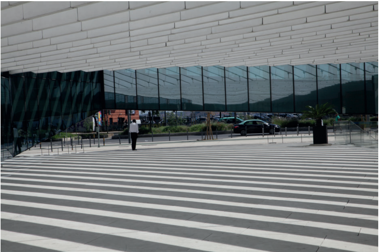
Picture of EDP headquarters by Aires Mateus in Lisbon. Francesco Caneschi, 2020.