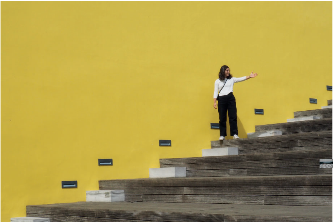
Picture of the School of Music by Carrilho da Graça in Lisbon.