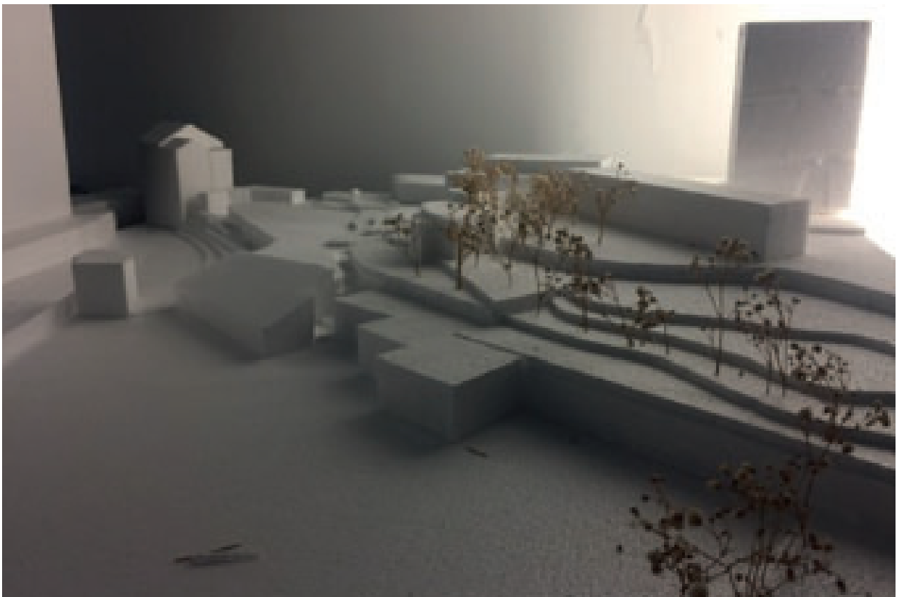
Pictures of a model realized during the internship.