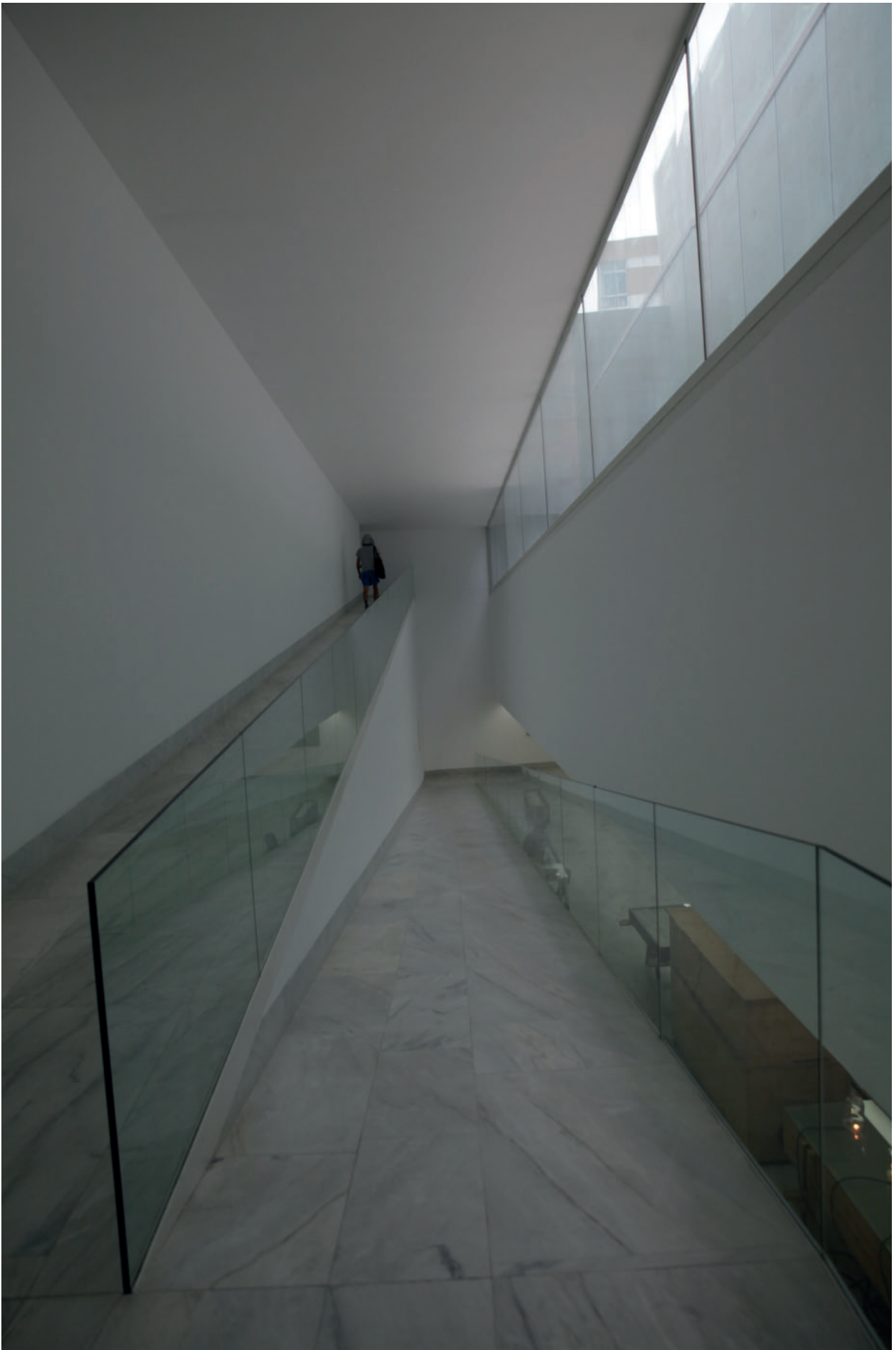
Picture of the Sines Art Center by Aires Mateus in Sines. Francesco Caneschi, 2019.