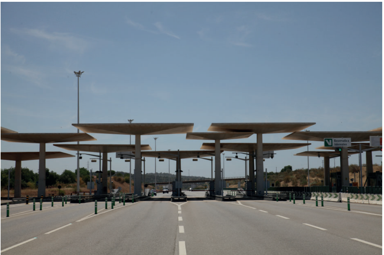
Picture of a gas station by Aires Mateus in Algarve. Francesco Caneschi, 2019.