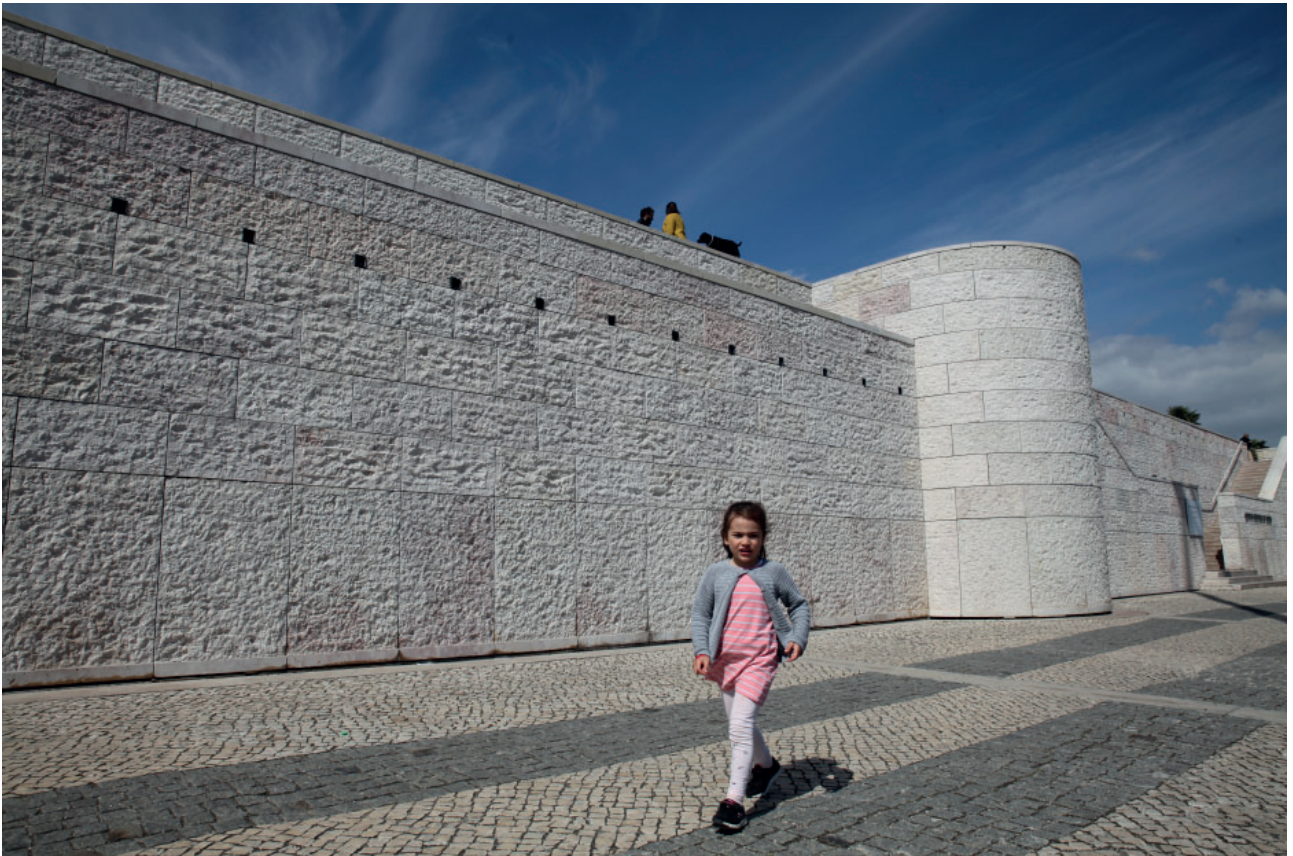
Picture of the CCB by Gregotti & Salgado.