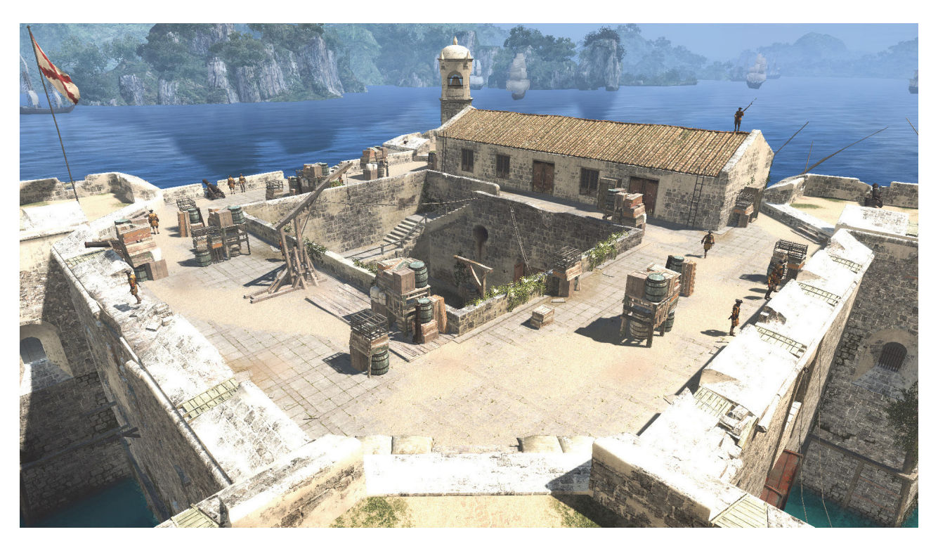
FIGURE 2: Castillo de la Real Fuerza as pictured in Assassin's Creed: Black Flag.

However, there are some noteworthy architectural structures that play a specific ludic role: restricted areas. These are delimited spaces in which the player cannot enter without being attacked. Areas like these are few and often mark the location of an important quest or treasure, and included in an iconic historical edifice. In Havana, the main Spanish city of the game, one of these locations is Castillo de la Real Fuerza . The Cuban fort, built during the third quarter of the 16<sup>th</sup> century, has been accurately reproduced in ACIV:BF . Its majestic walls and impressive defenses have the same ludic purpose as the real-life castle during the Spanish rule in the Antilles: to keep pirates away, Kenway included. It is one of the examples of an-